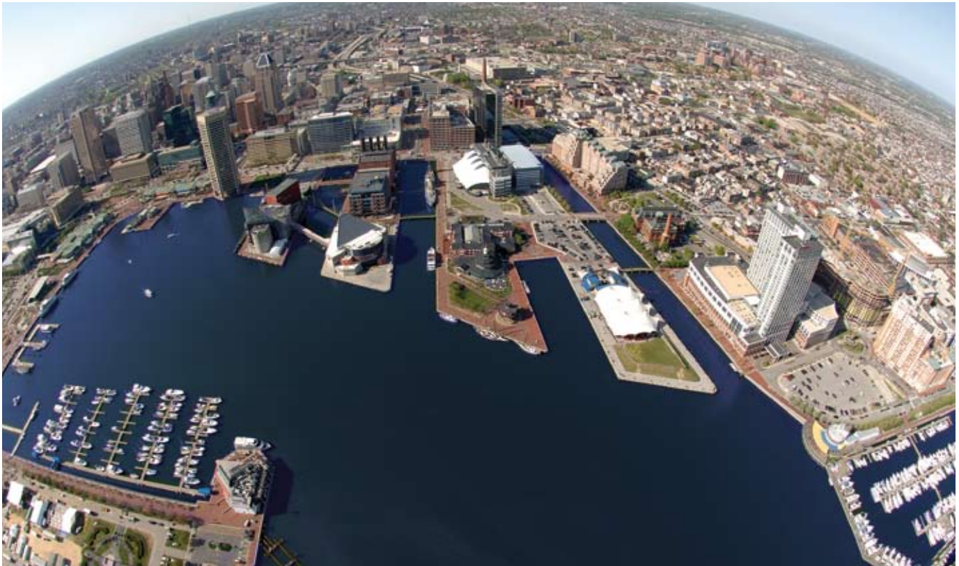
View of the Inner Harbor today.

memory now. The Inner Harbor, year by year, was sculpted with a world-class collection of uses and attractions: the National Aquarium, the Power Plant, the Gallery, the Hyatt Regency Hotel, the Maryland Science Center, Harbor Court apartments and hotel, Rash Field, Harbor Place, the USS Constellation, Scarlet Place, McKeldin Square and Meyerhoff Fountain, and the brand new Baltimore Visitors Center.