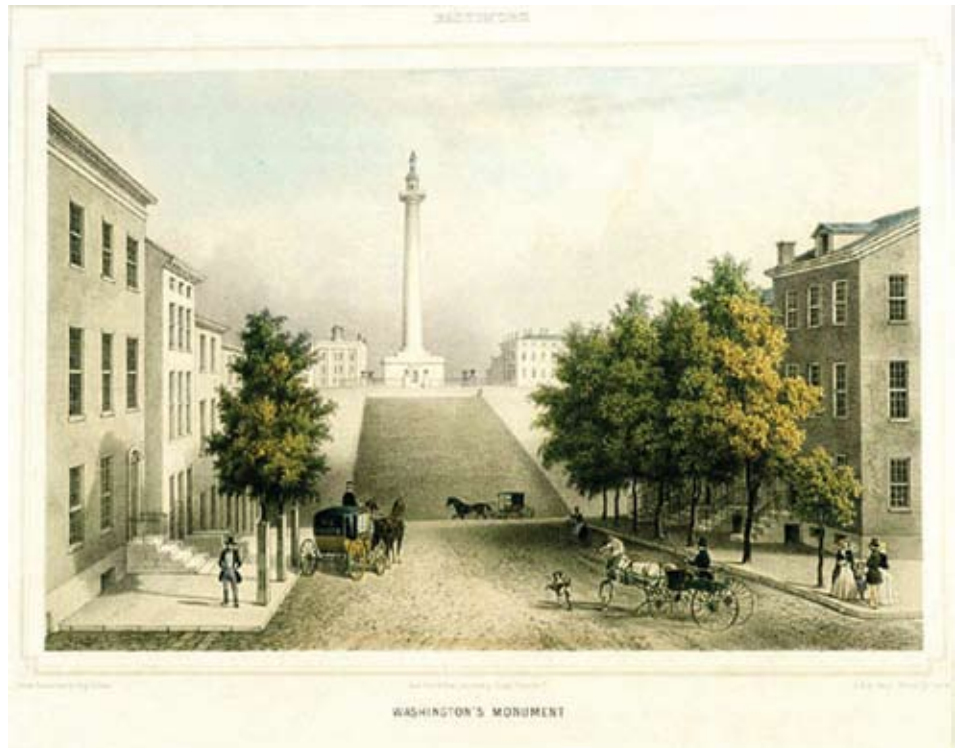
An 1848 image of the Washington Monument from Charles and Hamilton streets. The squares were first laid out as simple lawns.

Between 1850 and the Civil War, extraordinary changes spread through Baltimore's landscape. Cast-iron building technology transformed Baltimore's downtown. In 1851 the construction of the Sun Iron Building introduced cast-iron architecture to Baltimore and the nation. Its five-story cast-iron façade, iron