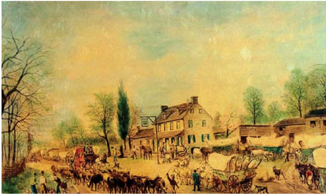
Fairview Inn was located on the Old Frederick Road. The inn, known as the "three mile house," catered to farmers bringing wheat, flour, and produce to Baltimore. This image was painted by Thomas Coke Ruckle around 1829.

street extensions. His plan consisted of a gridiron street pattern that created a hierarchy of streets: main streets, side streets and small alleys. This set in motion Baltimore's basic development pattern of various-sized rowhouses built on a hierarchical street grid. Catering to several economic classes, the larger streets held larger houses; the smaller cross streets held smaller houses; and the alleys held tiny houses for immigrants and laborers.