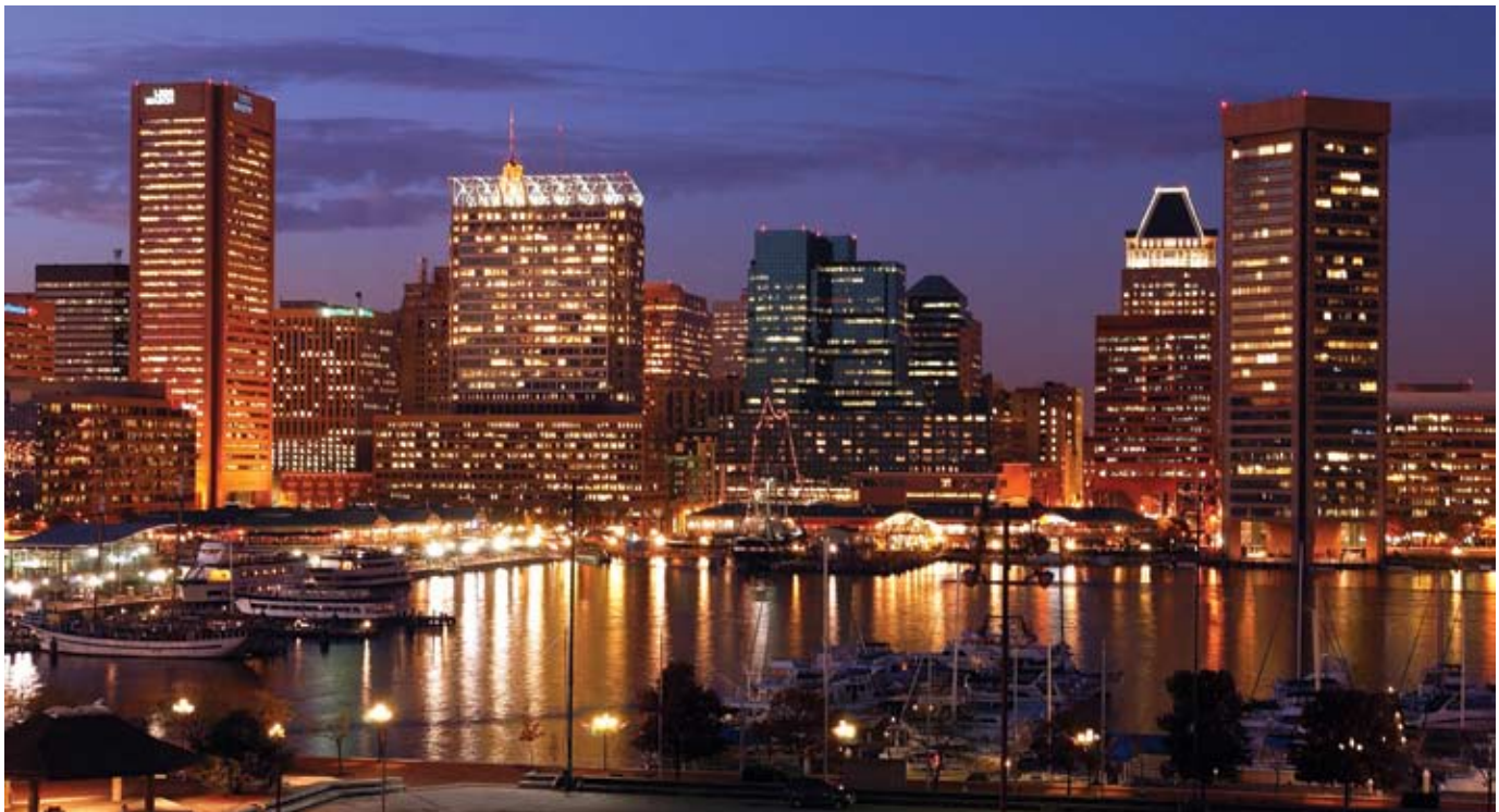
View of downtown Baltimore and the Inner Harbor at dusk.

Baltimore is simmering with creativity and entrepreneurs, musicians, artists, architects, engineers, researchers, and scientists are already moving our local economy forward. World-renowned medical research institutions, most notably Johns Hopkins and the University of Maryland, are potent engines for the future of Baltimore's economy. Both of the City's arts districts are gaining momentum. This year, Entrepreneur Magazine reported that Baltimore moved from 30th to 12th on their list of best cities for entrepreneurs, and we're number two in the East.