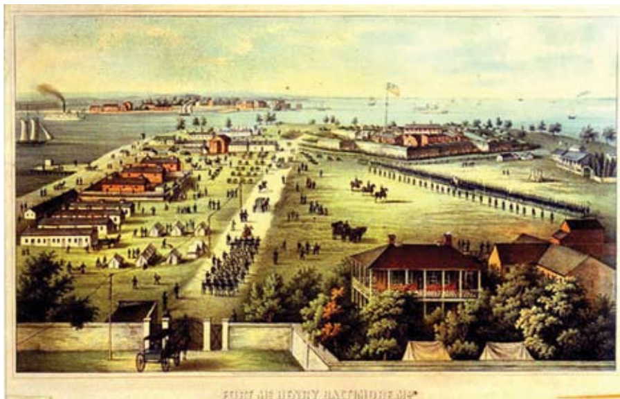
This 1865 view of Fort McHenry was published by E. Sachse and Company. Fort McHenry was the military post for Baltimore in the Civil War as well as a jail for Confederate prisoners.

At the same time, other economic forces were taking hold. Many mills along Jones Falls were converted to or built as textile mills. In 1808 the Union Manufacturing Company, built in the Mount Washington area, became one of America's first textile mills. Nearly twenty years later, mills along the Jones Falls were producing