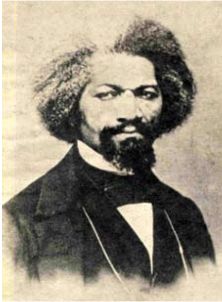
Portrait of Frederick Douglass. Douglass spent his early years in Baltimore where he learned to read and write. In the late 1830s, Douglass escaped to freedom while impersonating a sailor.

built the first purpose-built museum building in the Western Hemisphere and the second in modern history. The Peale Museum exhibited paintings, sculpture, and the bones of a mastodon excavated in upstate New York. During the first half of the 19th century, Baltimore's cultural activities grew as literary, science and social clubs were formed.