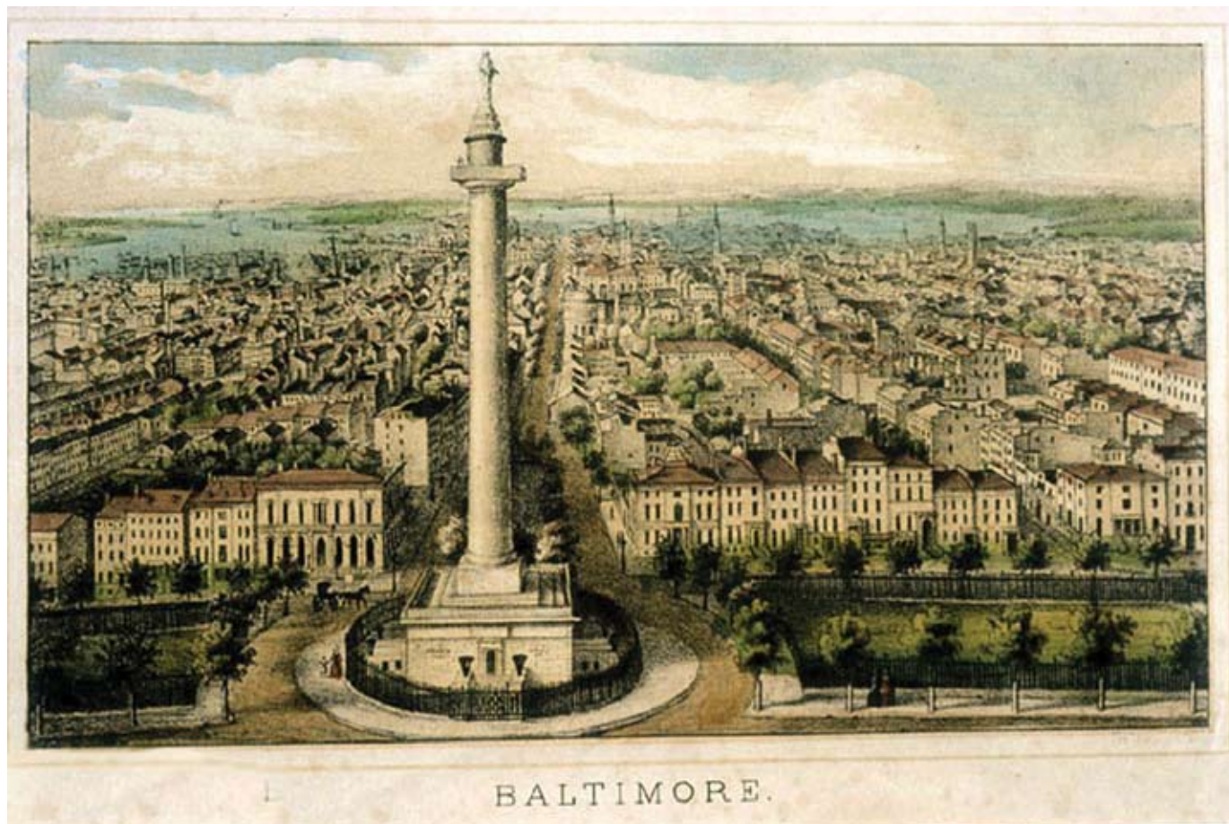
An 1850s-era view of Mount Vernon Place in relation with downtown Baltimore.

post-and-beam construction, and sculptural detailing were copied throughout cities worldwide. Back in Baltimore, 18 months after the Sun Building opened, 22 new downtown buildings incorporated cast iron into their construction. In 1857 the Baltimore Sun noted, “literally, the City of yesterday is not the city of today... The dingy edifices that for half a century have stood...are one by one being removed, and in their places new and imposing fronts of brown stone or iron present themselves.”