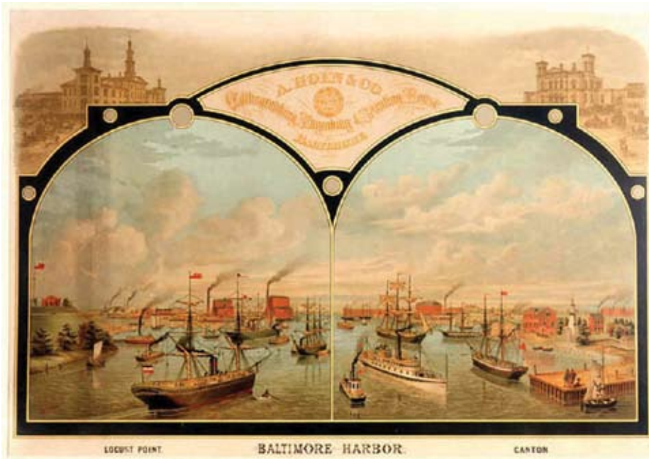
Baltimore Harbor image of Locust Point and Canton around 1860. Images of Camden Station (left) and the old Calvert Street Station (right) are located in the upper corners of the picture.

garment manufacturing center and the world's largest producer of umbrellas. Baltimore grew on its manufacturing strength, and industry expanded along the shorelines of Fairfield, Brooklyn, and Curtis Bay.