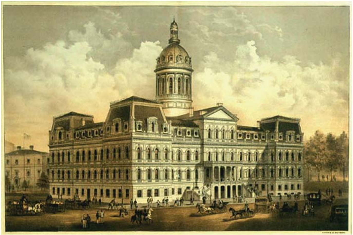
A lithograph of City Hall in 1875 by A. Hoen Company.