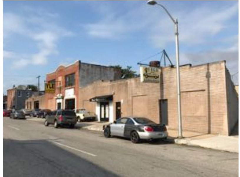
L to R: Rowhouses, 1000 block of Bonaparte Avenue; Y.L.E. Automotive Repair, 2412 Aisquith Street