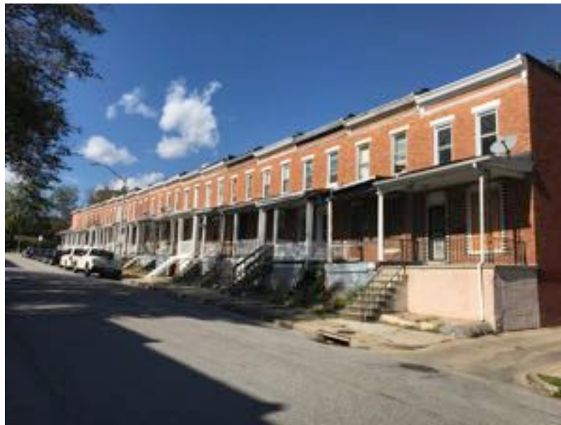
L to R: Marie Briscoe Park, 1562-1564 Abbottson St.; Rowhouses, 1500 block Abbottson St.