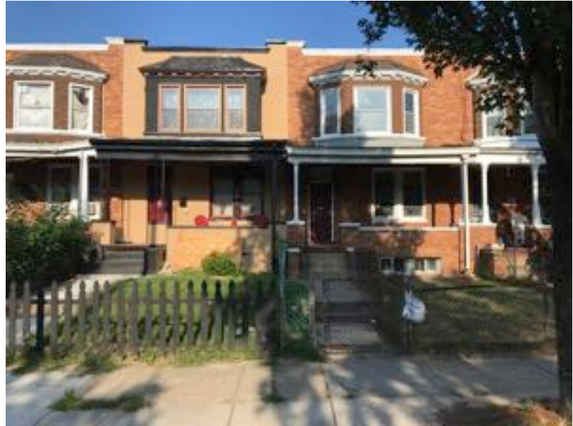
L to R: Rowhouses, 1600 block E. 25th St.; Porch-front rowhouses, 1900 block N. Wolfe St.