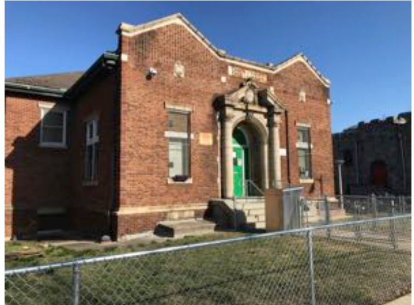
L to R: Columbus School Apartments/Former Public School No. 99 (1891), 2000 E. North Ave.; Clifton Park Branch, Enoch Pratt Free Library