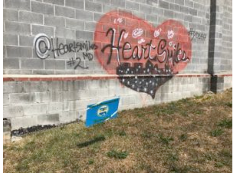
L to R: Rowhouses, 1700 block of Wolfe St.; Care-A-Lot vacant lot with "Heart Smiles" graffiti mural, N. Washington and E. Lanvale Sts.