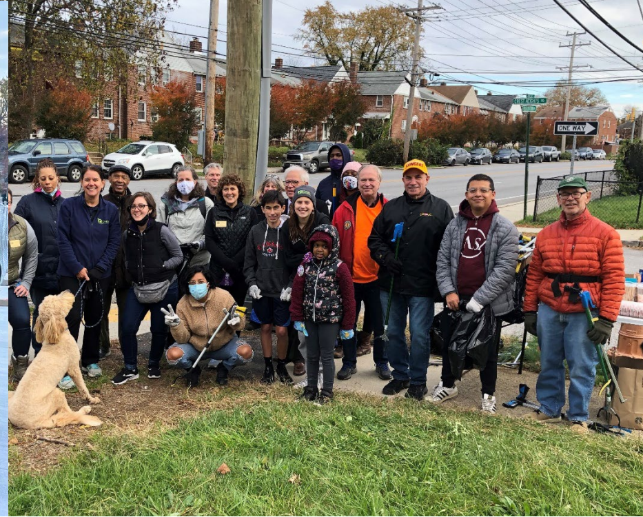
Photos show a recent community walk around Cross Country EMS, and a community clean-up organized by CASA and CHAI.