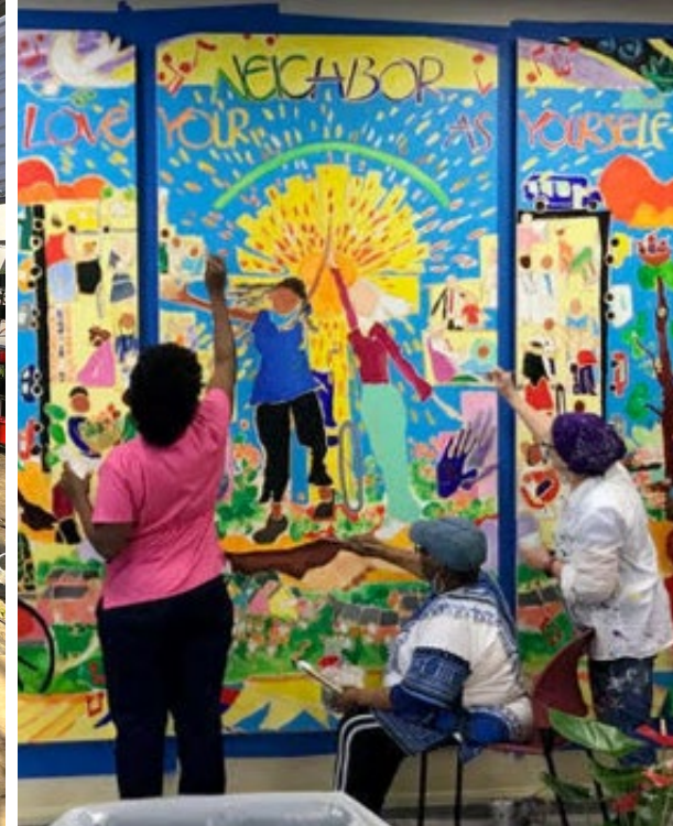
Candy Stripe Circle of Excellence; Plantation Park Heights Urban Farm; Park West Health Systems